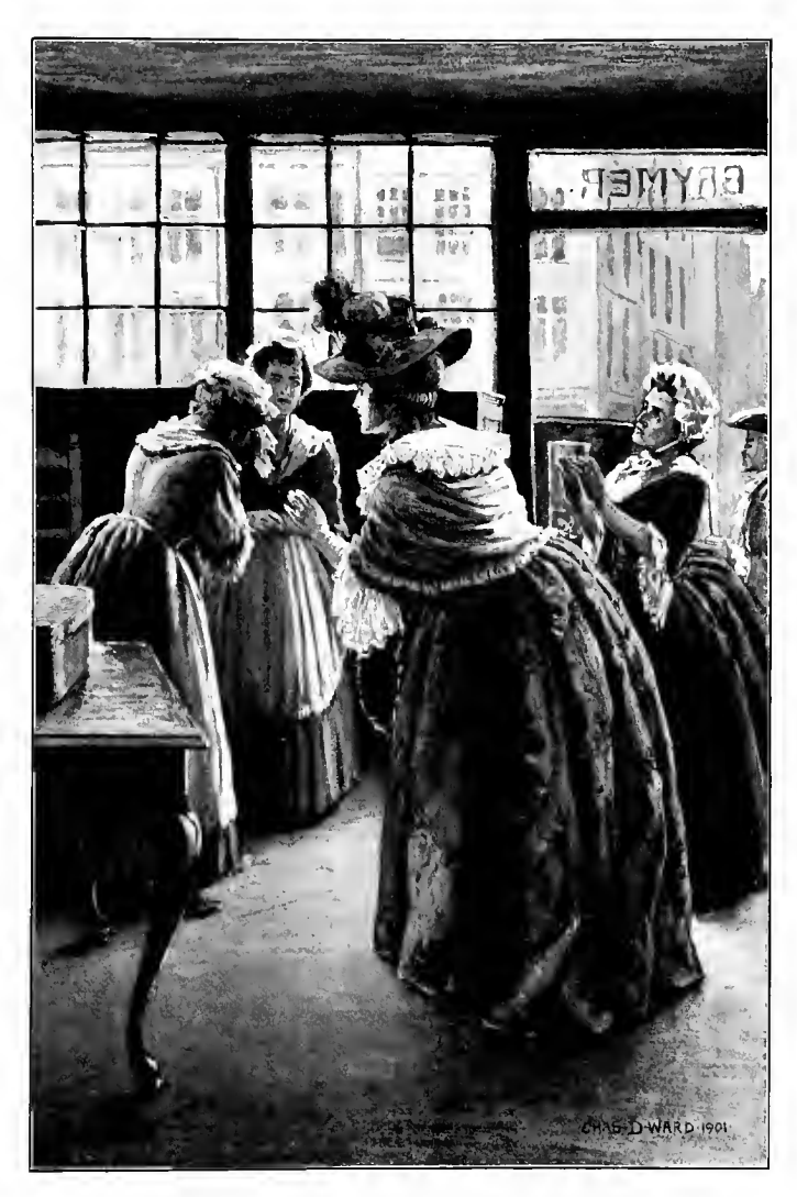
SO SHE STOPPED AND ADDRESSED THE GIRL.